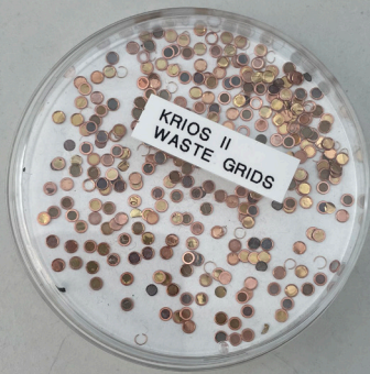
Specimens for scientific research