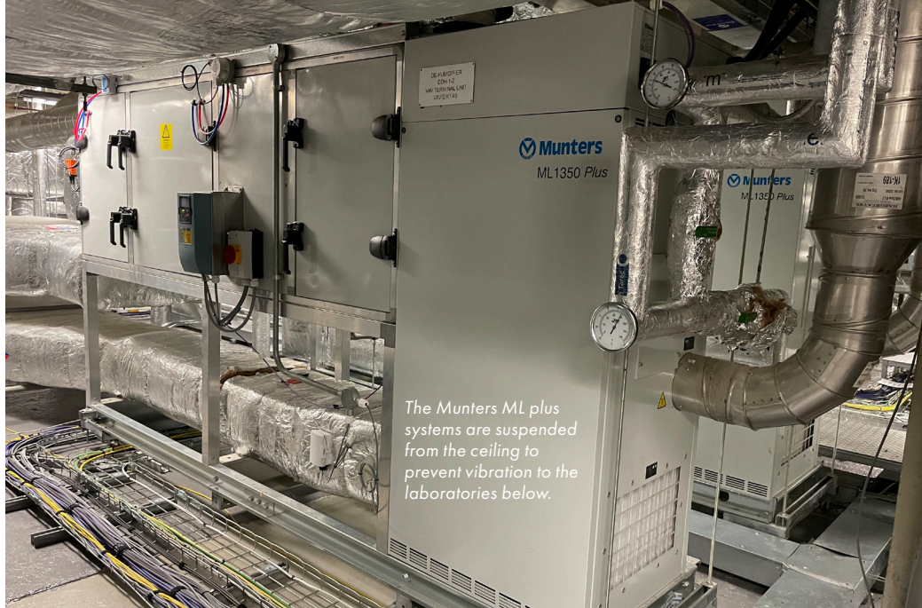
The Munters ML plus systems are suspended from the ceiling to prevent vibration to the laboratories below.