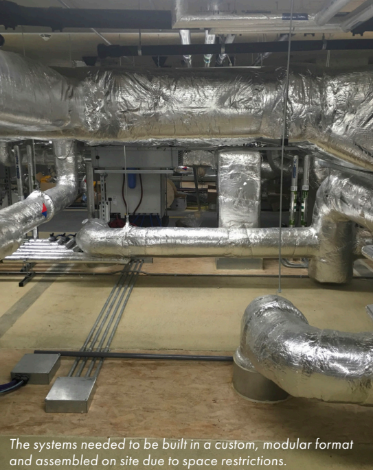
The systems needed to be built in a custom, modular format and assembled on site due to space restrictions.