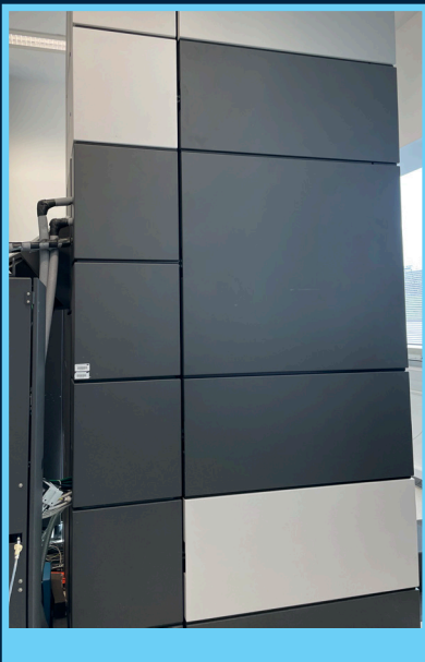
The exterior and interior of the electron cryo-microscope