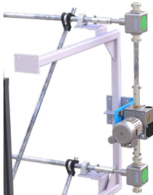
Powder coated framework and actuator

The framework is entirely powder coated with the support tubes and brackets welded in place to precisely locate your motor and rack and pinion system. This makes assembly very easy with no guess work or sliding clamps.