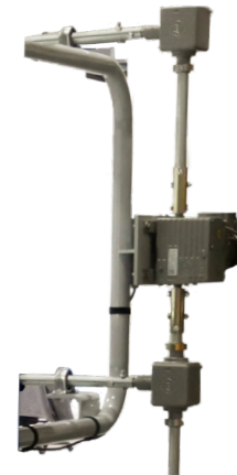
Powder coated framework and actuator

The framework is entirely powder coated with the support tubes and brackets welded in place to precisely locate your motor and rack and pinion system. This makes assembly very easy with no guess work or sliding clamps.