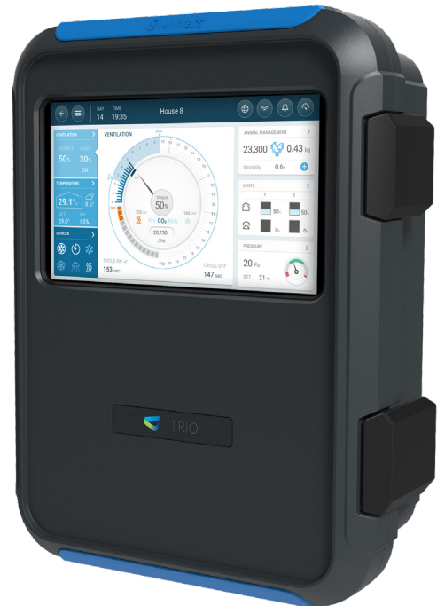
Munters Trio Poultry

IOT ready, Cloud Services, easy-to-use and real-time TrioAir App, personal Munters ID account