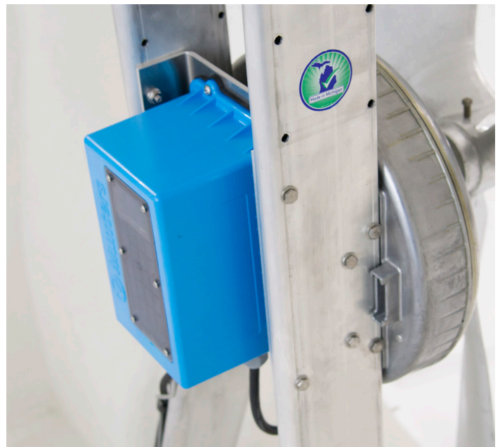
Munters Drive direct drive motor