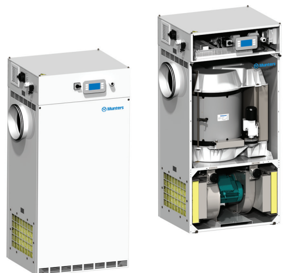
ML with Climatix Controls

ML Series dehumidifiers conform to both harmonised European Standards and to CE marking specifications.