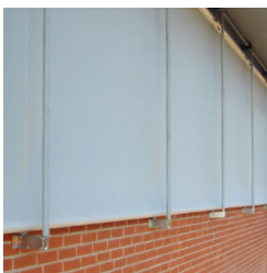
MFP wind protection pipe sets