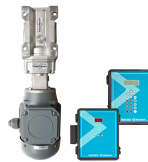
Motor drives with automatic control and emergency stop