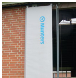
MFP wind protection sets