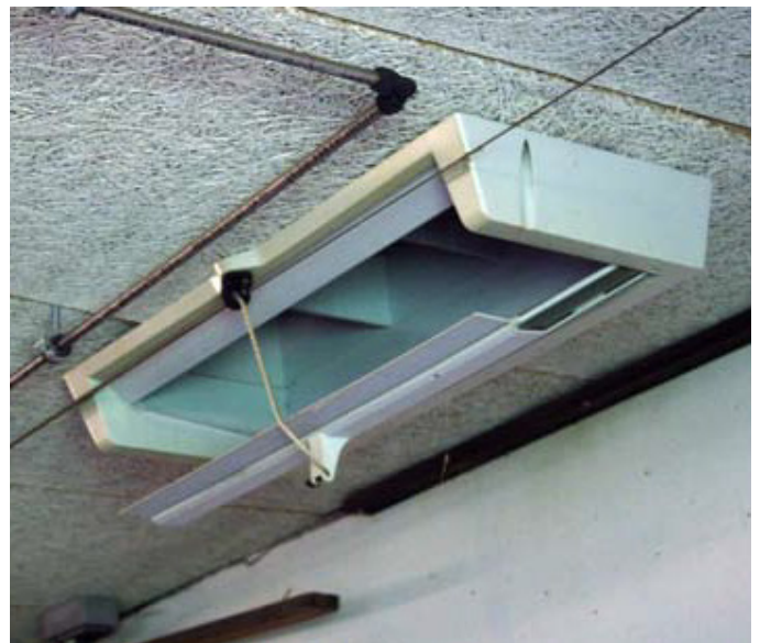
IL Air Inlet mounted into a pig stable.

During warmer periods the emphasis of ventilation shifts towards heat removal and cooling of the animals. In such conditions the air entering the structure can be directed down towards the animals, allowing heat removal from the animals' skins through a wind chill process. Once again the IL can be adjusted to ensure that the air reaches the animals.