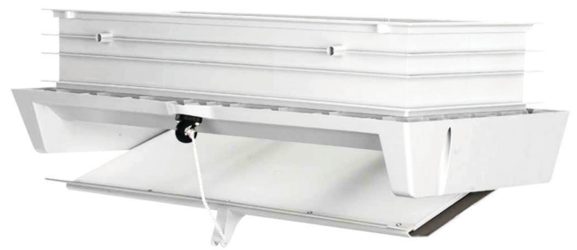
IL Air Inlet