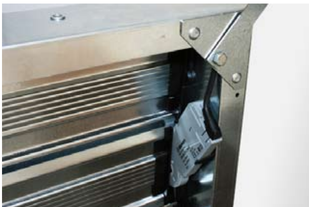
Each SMT can be fitted with an actuator to allow for the units to be opened and closed individually.