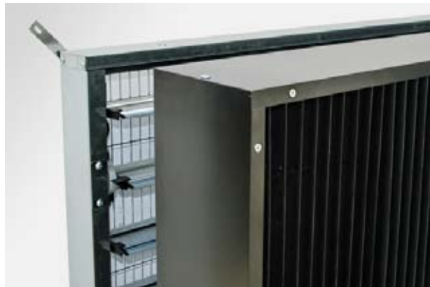
SMT can be used in combination with Lfd light filter if required.