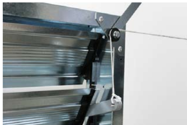
Each SMT can be fitted with an arm, which is connected to a common actuator for simultaneous opening and closing.