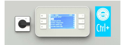
The new Climatix controller has an intuitive full-color interface, while keeping its original CE marking on the unit.

With decades of experience leading the dehumidification industry, we know what it takes to ensure the perfect climate for our customers. Trust Munters, convert today to keep your ML unit running like new!