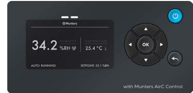
The new AirC400 controller has an easy-to-use interface, while keeping its original CE marking on the unit.

With decades of experience leading the dehumidification industry, we know what it takes to ensure the perfect climate for our customers. Trust Munters, convert today to keep your ML unit running like new!