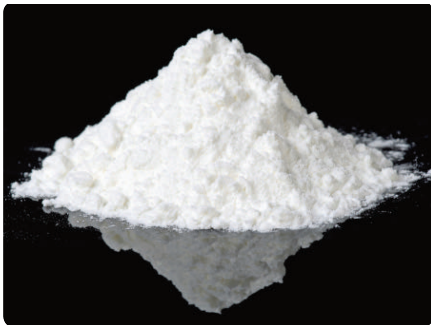
Figure 3: The angle of repose of a powder or granulate is the steepest angle of descent or dip relative to the horizontal plane to which a material can be piled without slumping. Often a measurement is taken in pre-production as a quality check to ensure material is flowing as it should.

It is easier to ensure temperature and humidity are controlled within defined limits (e.g. 72°F/22°C at 50% RH) supported by automatically generated logs. Keep in mind that varying air handling strategies may be necessary based on the location and local environment of each storage facility.