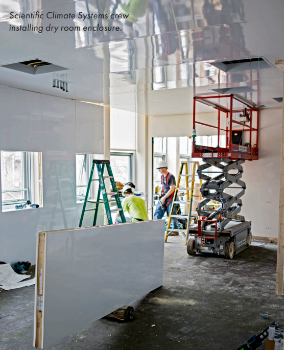
Scientific Climate Systems crew installing dry room enclosure.