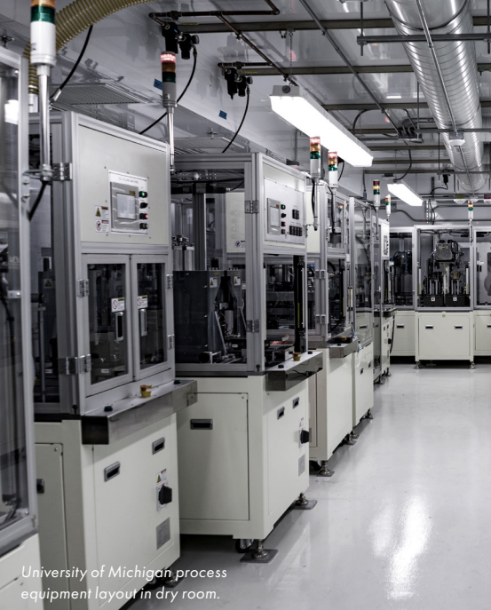
University of Michigan process equipment layout in dry room.