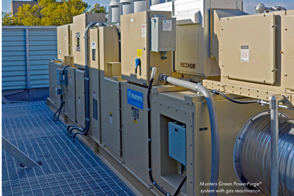
Munters Green PowerPurge ® system with gas reactivation.