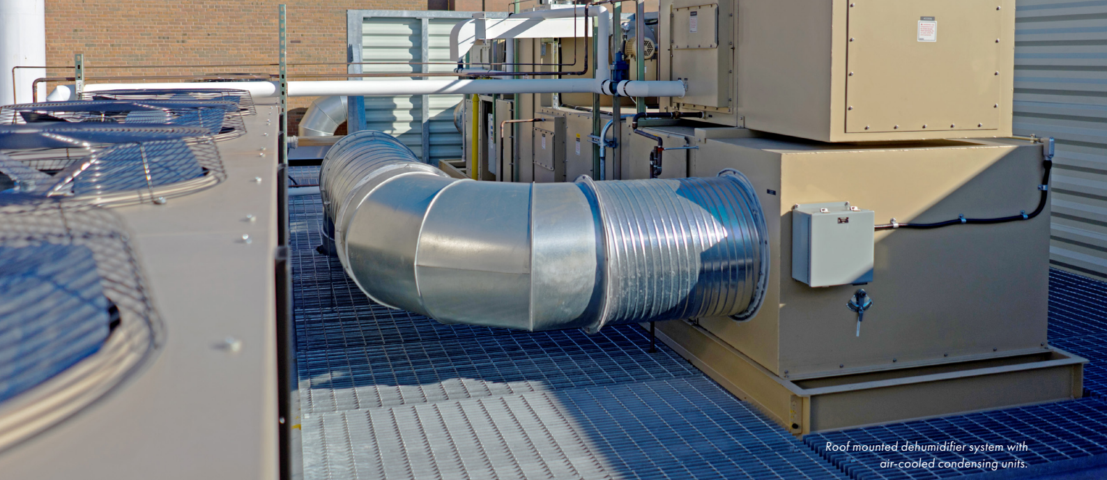
Roof mounted dehumidifier system with air-cooled condensing units.