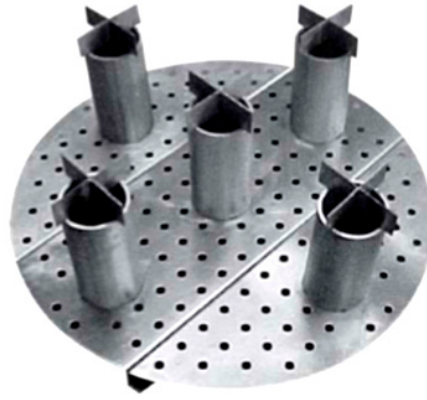
Heavy Phase Disperser