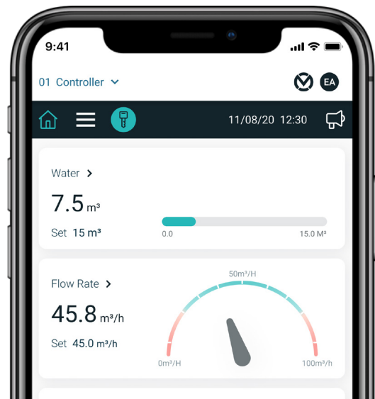
GreenField App dashboard - Mobile view

In the unfortunate case of errors, Munters GreenField App features a rich diagnostic package that makes troubleshooting an easy task.