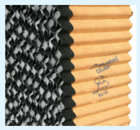
CELdek The only pad on the market with UL GREENGUARD Certification, ensures the safety of your animals and employees.