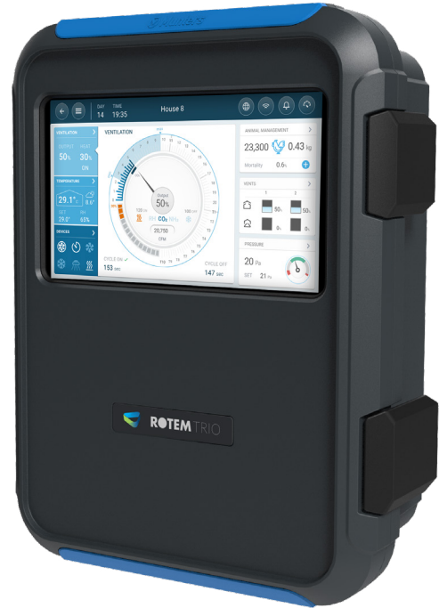
Munters Rotem Trio

IOT ready, Cloud Services, easy-to-use and real time TrioAir App, personal Munters ID account