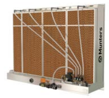
GX40 media assembled in Munters FA6<sup>™</sup> humidifier.

FA6 guarantees optimal cooling performance thanks to low pressure drop, low operational costs and no risk of over-saturation. Also the system is completely safe and hygienic. It is certified to ISO 9001, and the modular nature of the system means it's easy to install, service and clean.